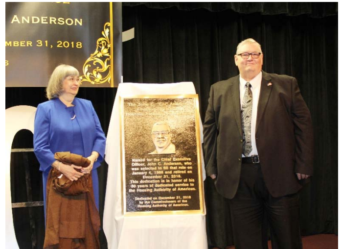
The bust revealed!!