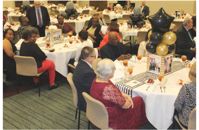
Employees & their guests begin to arrive.