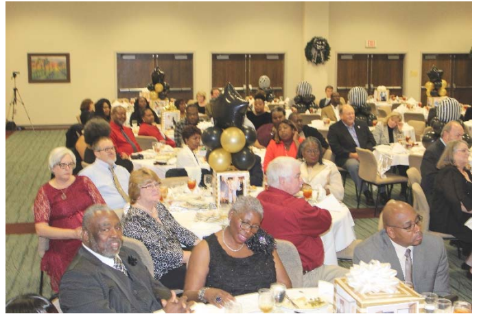
All of the guests enjoyed the evening.