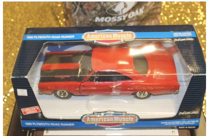
A brand new 1969 Plymouth Road Runner