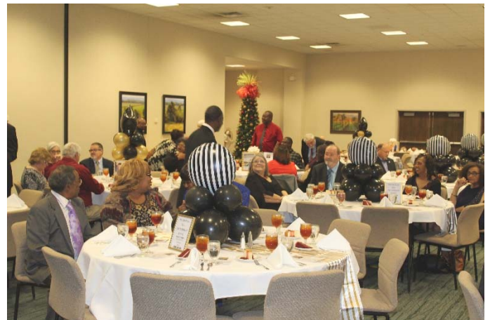
Board Members, office staff, and guests mix and mingle.