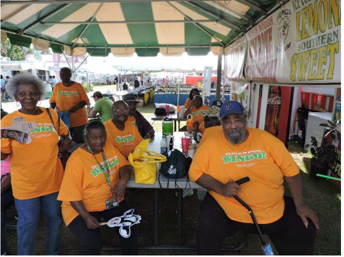
Seniors tired out, gathering to start trip back to Americus.

There was no shortage of people at the fair, even though we arrived before noon. There were fair goers from all school levels, other senior groups, head start and home day care groups. Tired from walking, the seniors enjoyed just sitting down, enjoying the delicious " fair food "; watching the diverse group of people walking back and forth on the fairgrounds.