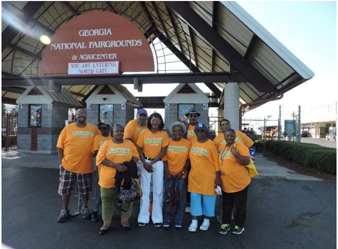
Seniors arrive early for a day of fair fun and fair food.

Excitement was in the air on the morning of October 11<sup>th</sup> as our Senior Bingo Club members boarded the Housing Authority shuttle bus at 9:00 a.m. and headed to the Georgia National Fair in Perry, Georgia. Only one thing was missing from the trip..... " fair weather ". As the thick morning fog dissipated, the temperature rose to that of a hot, summer day. Nevertheless, the seniors were thrilled about visiting the fair.