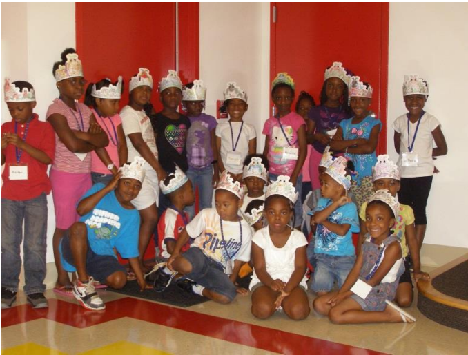
Reading Pals made royal crowns for their heads.

It's that time again..... SUMMER READING PALS 2019 is just around the corner!! The Housing Authority is gearing up for another summer of reading and fun for our 1 st and 2 nd graders.