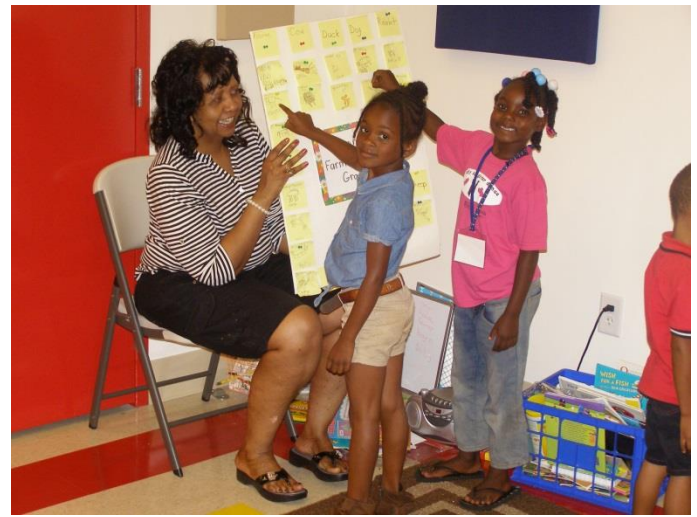
Reading Pals enjoy the learning activities.