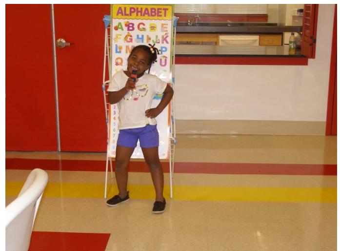
Reading Pal learns to sing The Alphabet Song.

There is absolutely NO COST to the parents. The Housing Authority provides the Summer Reading Pals Program absolutely FREE!! All aspects of the program ( meals, field trips, tee shirts, daily transportation, and snacks ) are financially covered by the Housing Authority. All that is required of the parents is to make sure that your child is on his or her best behavior each and every day of class; and that your child attends class each and every day.